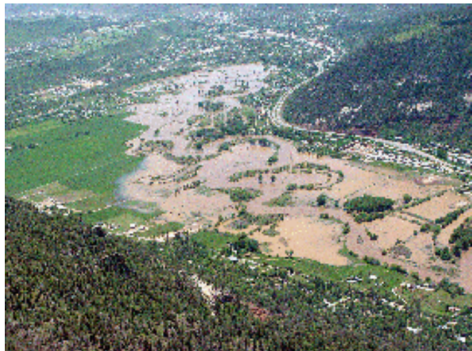
Snowmelt flooding along the Animas River in northern Durango, CO (NWS)

Residents of Atlanta, ID, are stranded after flooding washed out 150 feet of road along the Boise River. Atlanta is a small mining and logging settlement about 75 miles east of Boise in the Sawtooth National Forest. FEMA Region X will join Idaho officials to conduct Preliminary Damage Assessments of flooded areas.