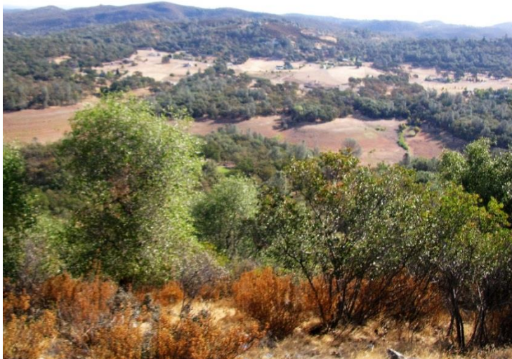
Photo of Area to be treated in the foreground