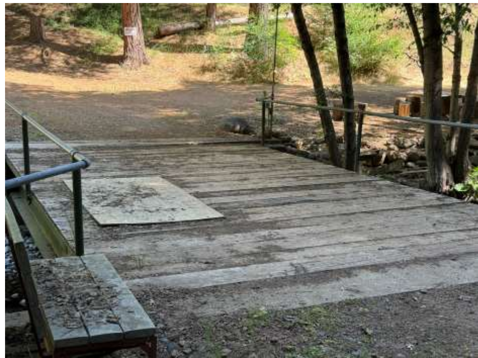
Alida Street starts at the bridge