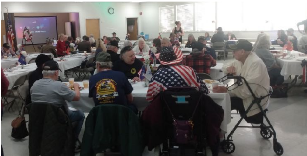
EDCFSC sponsored Veteran's Day Breakfast November 2023

Did you miss last year's great 2-day, free training to become a volunteer assessor in your Fire Safe Council? Providing knowledgeable, 1-1/2 to 2 hour home-specific assessments on both defensible space and home hardening can be an important impetus for residents to do effective wildfire preparation. To sign up for the training, contact Hugh Council . To request a free assessment of your own house/property, contact Carri Lueck